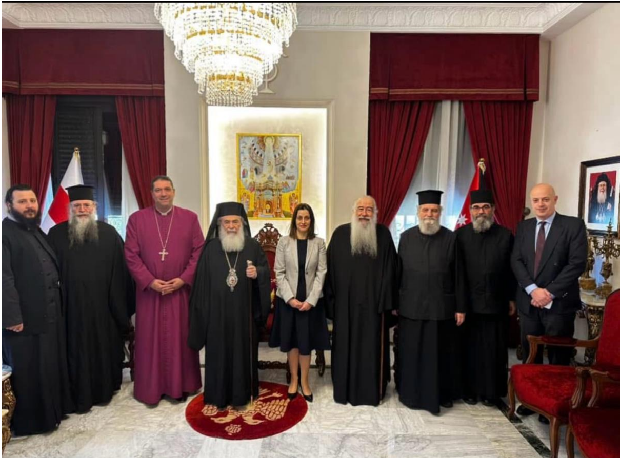
of Church leaders in Jerusalem