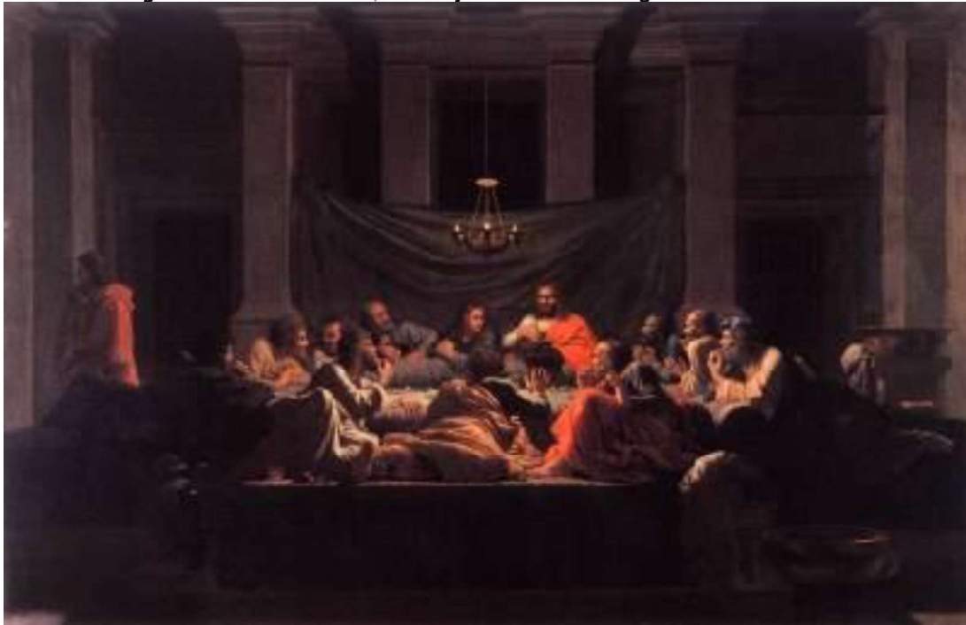
The Eucharist [1647] by Nicolas Poussin (1594 – 1665)

Lord, make me an instrument of your peace. Where there is hatred, let me sow love; where there is injury, pardon; where there is error, the truth; where there is doubt, the faith; where there is despair, hope; where there is darkness, light; and where there is sadness, joy.