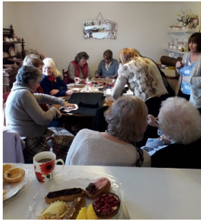
Very intense concentration making African pictures!