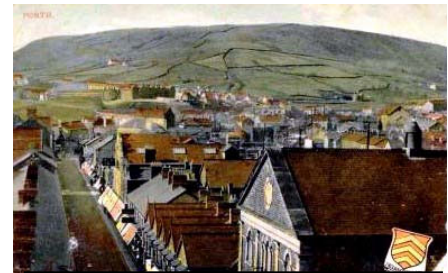
Hannah Street from 1910. All the chapels were built by miners out of local stone. The Chapel is first on the right.

Later, on Sunday the girls and boys in their best clothes used to walk through Hannah Street with the girls on one side and the boys on another. Whilst called for whatever reason 'The chicken walk' it was absolutely innocent and it followed the habits of our parents.