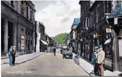
Past Times - Hannah Street, Porth

Porth in English means gateway and following the name it is the starting point of the Rhondda Fach and Fawr valleys.