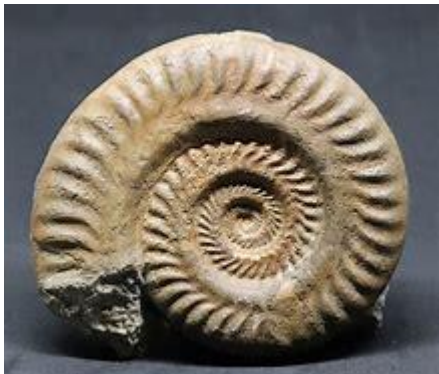
Fossil Ammonite Hildoceras

*Hilda is a significant figure in the history of English Christianity. As the abbess of Whitby – a monastery for both men and women – she led one of the most important religious centres in the Anglo-Saxon world. In 664 Hilda’s monastery hosted the Synod of Whitby, which set the course for the future of Christianity in England. Hilda was seriously ill for the last six years of her life and died in her monastery at Hackness, 14 miles from Whitby in 680 at the age of 66. She was buried at Whitby, though her remains were later moved to Glastonbury. There are many legends about St Hilda. Folklore claims that St Hilda freed Whitby of all evil snakes by flinging them from the Abbey cliffs. It is thought that this is the medieval explanation for all the spiralled ammonite fossils that